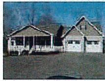
New Homes & Additions