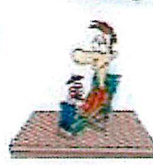
Decks over 8" above ground.